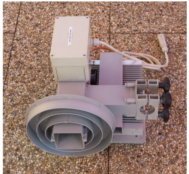
OK1DFC's 13 cm feed with 250 W SSPA and LNA

SP/OK5EME: Zdenek (OK1DFC) writes that he will be active during the Microwave and EME meeting in Poland. The meeting, which is organized by the SP EME group in Zieloniec is on 14 to 17 Aug -- see http://splashurl.com/m4pse58 . I will be there with my 3.2 m portable dish and 250 W at the feed and TRV for all 13 cm possible band segments. I will have also available a 10 GHz unit with 35 W at the feed and will try some contacts on 10 GHz too. This is the same setup I am expecting to use during my expedition to ZA in future. The 10 GHz equipment will be tested for the first time to give me some experience with how the system, especially my mesh dish with a 0.2° BW, will work. My plan is on Friday 15 Aug to build and test station on 13 and 3 cm, on Saturday 16 Aug to operate 13 cm for my full Moon window, and on Sunday 17 Aug do 10 GHz tests, then wrap up and drive home in the evening.