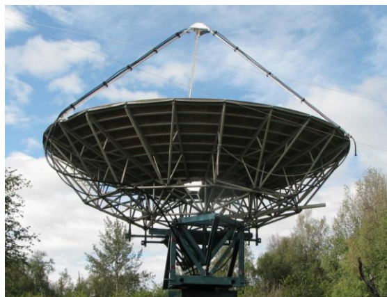
KL6M has his 30' dish back in operation with both coax for low bands and waveguide feed for 6 cm

contacted when the polarity alignment was apparently sub-optimal for my fixed polarity array as they were later heard with much stronger signals. QSOs were logged with SM4IVE, G3LTF, K2UYH, and NC1I. Other stations heard include G4RGK, UT5DL, UA3PTW, and DG1KJG. Unfortunately, I had no opportunity to call the latter 4 stations as they were only heard while in QSO with other stations or when replying to the CQs of others. I did attempt to call CQ, for a while (1000 to 1030), but I was unable to hear any replies. Many thanks to all for the activity! I plan to be QRV again in Aug.