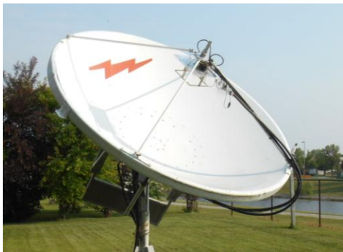
VE4MA 10' dish on 432 with feed

VE4MA: Barry ve4ma@shaw.ca decided to get back on 432 for the first time in years to help promote CW activity – I was QRV on 432 for the 70 cm ATP on 20 July with a 10' dish running my tropo station, RIW at only about 500 W in the shack with my old K3BPP dual polarity (2 x EIA standard gain with coax feedlines). The feed was backed up a bit from the focus in order to get a good VSWR, but then this dish is so small on 432 that I don't think that is a big issue. I still see 6.4 dB of Sun noise and worked G3LTF, SM4IVE, UA3PTW, NC11 and K2UYH. Signals were very good, although when I worked AI the signals seemed to be poor. The Sun was finally up by then. I have copied many 4 yagi stations using WSJT and only a few hundred watts.