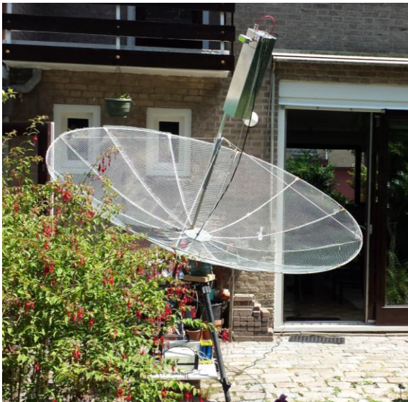
PA0HRK's portable 2.4 m dish

PA0HRK: Harke harke.smits@hccnet.nl is hearing on 23 cm and hopes to be on TX soon -- I recently received my first EME signals. I have constructed a stress type 2.4 m prime focus dish that can be dismantled in triangular sections. The support structure is made of 8 mm fiberglass rods, used in the kite industry. It is like a classic wheel with 12 spokes, 1.2 m each. A rim forces the spokes into a parabolic shape. Spokes and rim are connected by means of hard soldered T shaped brass tubing. The reflector is made of triangular pieces of 10 mm mesh. I need only four ropes to make the structure rigid enough for use as a dish. The system can be set up in about one hour. Normally it's in the garage. The 23 cm feed is OK1DFC circular horn; the LNA is a WA2ODO design (NF 0.25 dB). I also made a RA3AQ feed for 13 cm, but I am focusing first on 23 cm. I only have 6 dB of Sun noise, but that's probably because I cannot find a good cold direction in my small back yard. I have only a slot of two usable hours. I have heard SM4IVE and I1NDP, both on CW. I now need to work on the TX. I already have a 150 W PA. I will be attending the EME conference in Brittany (also for the first time) and am looking forward to meet other more experienced EMEers there.