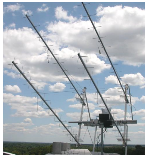
W2PU's 4 x 15 el cross yagis on 432

W2PU: Joe k1jt@ARRL.NET reports that the club station at Princeton University is now QRV on 432 -- We're continuing to make good progress on the 70 cm EME setup at W2PU. Our antenna is now an array of 4 rear-mounted, 15-el dual-polarization yagis. With the present solar flux (S-410 = 45 SFU on 7 Aug), we see nearly 10 dB of Sun noise. The TX power is about 600 W. In the first few hours of being QRV, we put JT65B EME QSOs with LU8ENU, K3MF, and KD5CHG in the log. The latter two were done at an especially poor time of the month, with degradation around 5 dB. We hope add many more initials during the coming DUBUS 432 Digital EME Championship event! [Since this report W2PU has added several additional QSOs].