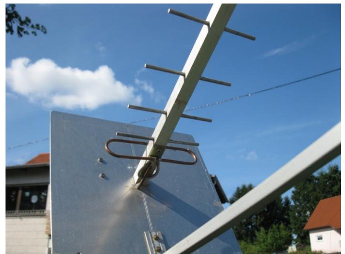
DJ2DY's yagi feed -- see full yagi picture in July NL

SOME PERSONAL THOUGHTS ON THE ARRL EME CONTEST BY RICK, K1DS: Several stations have capability on 7 bands, and knowing which to operate and when is a challenge, as there is no current agreement between EME aficionados on activity windows for each band, in addition to the moon window being continually in motion