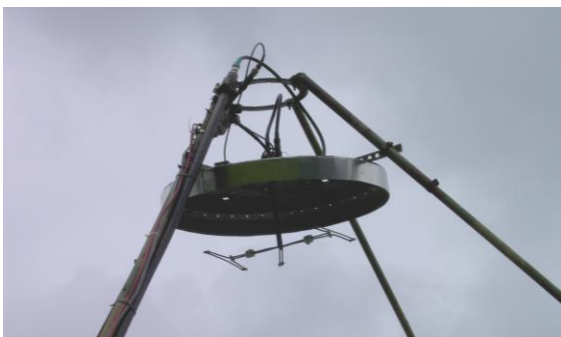
G3LTF's improve 432 feed with baffle

JA4BLC: Yoshiro's ja4blc@web-sanin.co.jp EME report -- I worked on 3 cm on 12 July JA8ERE (O/O), JA6CZD (559/569) and JA1WQF (559/559), and on 23 cm on 20 July JA1WQF (559/559), JA6AHB (559/O) and JA8ERE (559/549), and on 26 July JA6XED (559/449). There is very good news on 13 cm. In late July the Japanese Radio Authority sent out a request for public comment on spectrum usage for 2400 – 2405 MHz by Japanese moonbouncers. If they receive positive comments, they will permit operation on a new band after 5 Jan. 13 cm moonbouncers need to prepare receiving gear for 2400. I am not sure if we will lose 2424 after Jan 2015. My hope is that both bands remain usable.