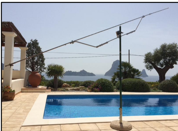
EA6/KT6Q 49 el yagis used by HB9Q

EA6/KT6Q: Dan dan@hb9g.ch put Balearic Islands back on 23 cm EME -- I was QRV using my US-call for several hours on each of 3 days during my vacation on Ibiza Island (JM08ov) this April. It was a great experience to be again the DX and of course to be QRP. I was using Bodo's (DF8DX) equipment of 1x49 el yagi horizontal, 2.5 m above ground, no preamp, 5 m cable and about 90 W at the dipole. I worked the following stations: HB9Q (14DB/17DB), UA3PTW (27DB/22DB), DG5CST (27DB/25DB), PA0BAT (29DB/27DB), DJ9YW (28/27DB), I1NDP (26DB/22DB), OK1DFC (22DB/23DB), JA6AHB (29DB/26DB), OK1KIR (22DB/21DB), UA4HTS (27DB/25DB), OK2DL (23DB/25DB), DF3RU (28DB/26DB), PA3DZL (29DB/26DB), PY2BS (25DB/27DB), OE5JFL (23DB/21DB), G4CCH (26DB/26DB), K2UYH (25DB/23DB), DL6SH (27DB/23DB) and ES5PC (26DB/27DB). I also decoded but did not work W5LUA, ES6RQ, YL2GD and OH2DG. Many thanks to all those working me or trying to work me. Since it was a great pleasure to be QRV QRP EME, I will try to use my next vacation for another short activity.