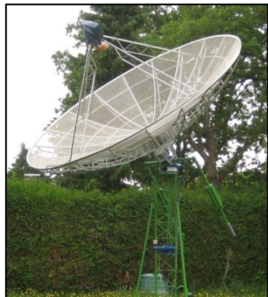
DJ8FR's 4.9 m dish

DJ8FR: Juergen juergen@dj8fr.de sends his 23 cm DUBUS CW contest report -- This year I had to live with a visit from Murphys at the beginning of the contest. I lost 3 hours working in the rain make repairs at my dish. Of course the rain stopped after repair was done! I ended with a score of 42 x 36 . I used my 4.93 m dish and 300 W at the feed. My initial count on 23 cm CW (all on random) is now 106 after some 4 years of activity. I still need Africa for WAC. [Try writing 7Q7EME for a CW sked].