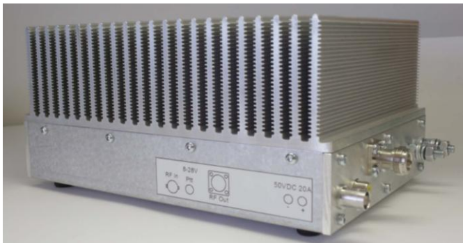
SM4DHN's new 500 W 1296 SSPA for sale

W8BYA has for sale (2) Narda Model 3752, 1.0 GHz to 5.0 GHz phase shifter units, both in excellent but used condition. He also has a Narda Microline Model 791FM 2.0 GHz to 12.4 GHz variable attenuator, also used but very clean, and two uW circulators; a Western Microwave, Model 3JA-2088 and a E&M Laboratories Model U22Y (700 MHz to 1 GHz). If interested contact Gedas at w8bya@mchsi.com .