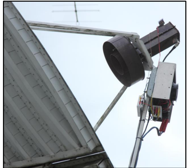
ES5PC's new 1 kW SSPA mounted by his dish's feed

was very good during both days. My own echoes were at least as good as on 13 cm with a 500 W SSPA. I worked several new ones including JH3EAO, NC11, ES6FX, LX90IARU, VE6BGT, OK1YK, PA3CQE, N8CQ, VE4MA, PA2DW (new on CW).